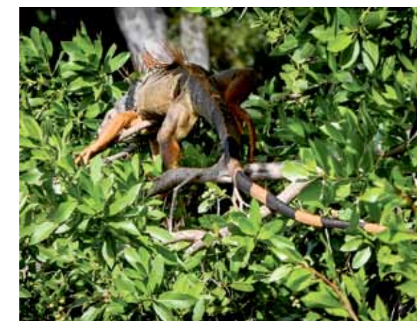
Adult male Green Iguana takes on a bronze tone when in mating season.