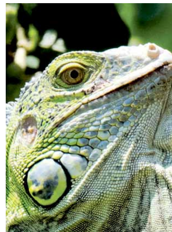
The eye of a green iguana, and a second "eye-like" armored scale, which sits on the cheek of both sides of the iguana's head.

It is hard to calculate how many iguanas there are. A friend hunkered down in his home during hurricane Irma was amazed at how many iguanas were in the trees; as the storm raged on, soon revealed were dozens of iguanas, clinging to the defoliated branches. Cold blooded, they fall from the trees when temperatures go below 45 degrees, an opportune time to reduce their population. Green iguanas are here through no fault of their own, but I'm all for the death penalty due to their destructive behavior; call a Nuisance and Wildlife Management Pro, to do it humanely.