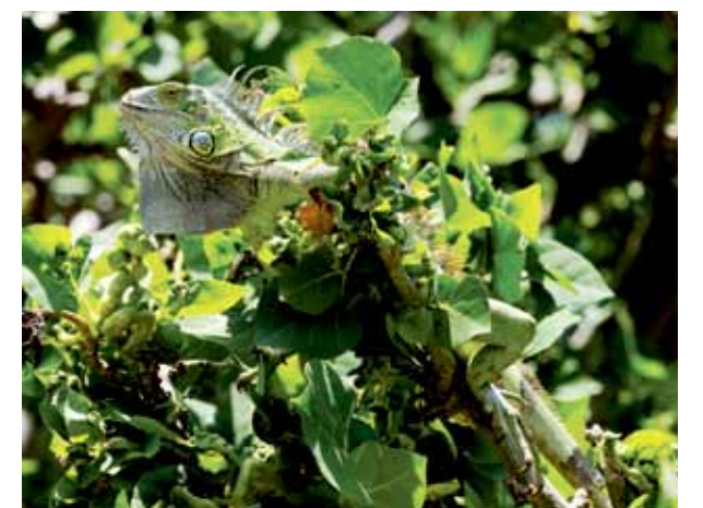
Adult iguanas feed on foliage, flowers and fruit. This male is enjoying basking in the sun high above the reach of potential enemies.

There is one reptile in my yard, who can be heard during May at dawn and at dusk, but rarely seen. Its diet includes insects, baby birds, and small mammals such as nesting mice. It lives in tree crevices, and even inside structures, behind suspended ceilings or within walls. A native of Southeast Asia, the Tokay gecko's call is described as "tuck-too," too-kay; it was this sound that prompted U.S. troops in Vietnam to informally dub it the "F*ck You" Lizard... an informal "reception committee," and the only ones there speaking the truth.