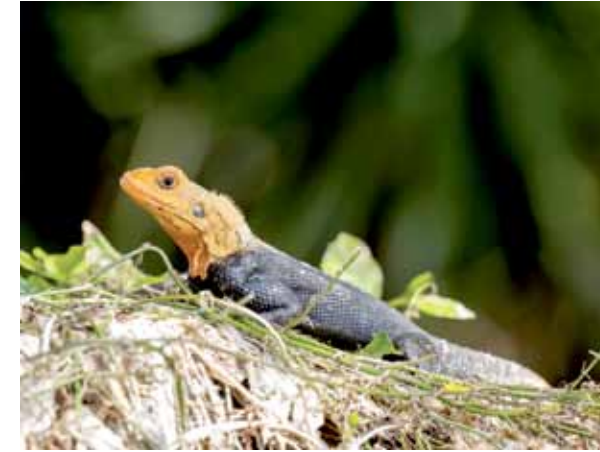
Peter's Rock agama generally don't stray far from the cover of rocks, or other hiding places. Male on the left; female on the right.