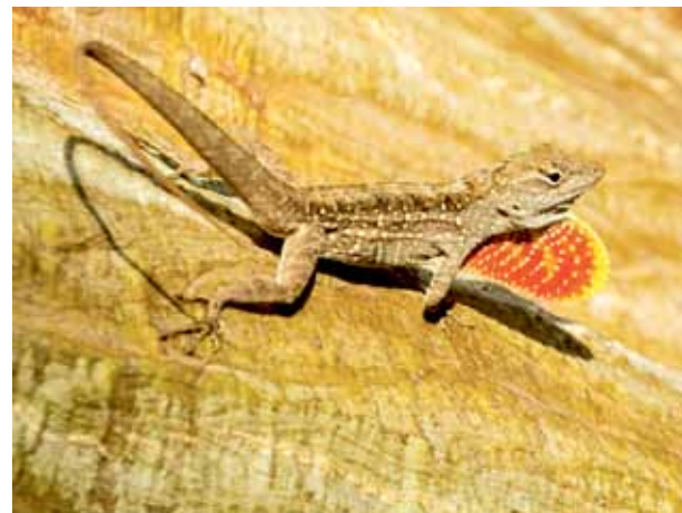
(Left) Male Cuban brown anole shows off his inflatable throat membrane in order to attract lady lizards. They also do "push-ups" as part of their display.

when perched on a leaf, or turning brown when resting on a tree trunk. They did their job taking care of bugs in the yard, and provided a good source of entertainment. But then came the Cuban brown anole, a slightly larger lizard, easily identified by the mating male's conspicuous bright orange dew-lap, and push-up behavior. They eat bugs and spiders... and other lizards. These Cuban cousins have more offspring than the Green