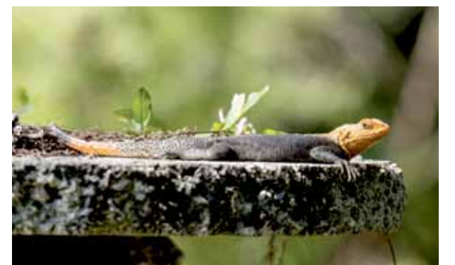
Adult Peter's Rock Agama males are boldly marked with an orange head, black body with more orange and then a black-tipped tail.

There is one reptile in my yard, who can be heard during May at dawn and at dusk, but rarely seen. Its diet includes insects, baby birds, and small mammals such as nesting mice. It lives in tree crevices, and even inside structures, behind suspended ceilings or within walls. A native of Southeast Asia, the Tokay gecko's call is described as "tuck-too," too-kay; it was this sound that prompted U.S. troops in Vietnam to informally dub it the "F*ck You" Lizard... an informal "reception committee," and the only ones there speaking the truth.