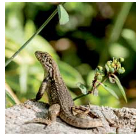
Curly tailed lizards were introduced to Florida in the 1940's by sugar cane growers seeking to control insects. They live in dry areas, under coral rocks in the Keys and eat bugs and insects, but also flowers.

Hold your position in the trees, my Green anole buddy! I've got your six.