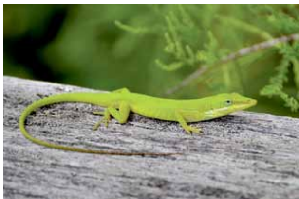
Florida's native green anole are in decline due to the presence of the Cuban brown anole.

Not long ago the Green anoles were the majority of lizards found in my yard. Some had tails, and others not, thanks to my cats, but they were plentiful. They were great with camouflage, body green