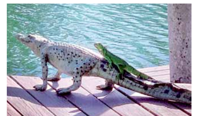
Hitchhiker photo by Video Dave.