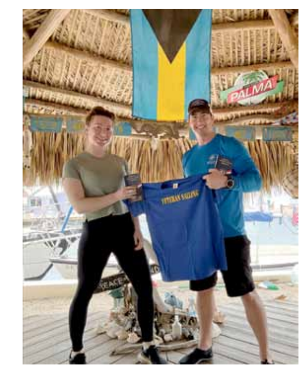
Elks Vets on the Water.