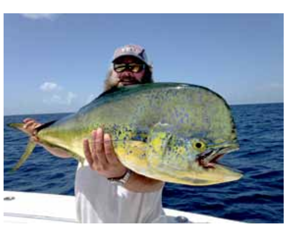
Pirates Cove Watersports Fishing!