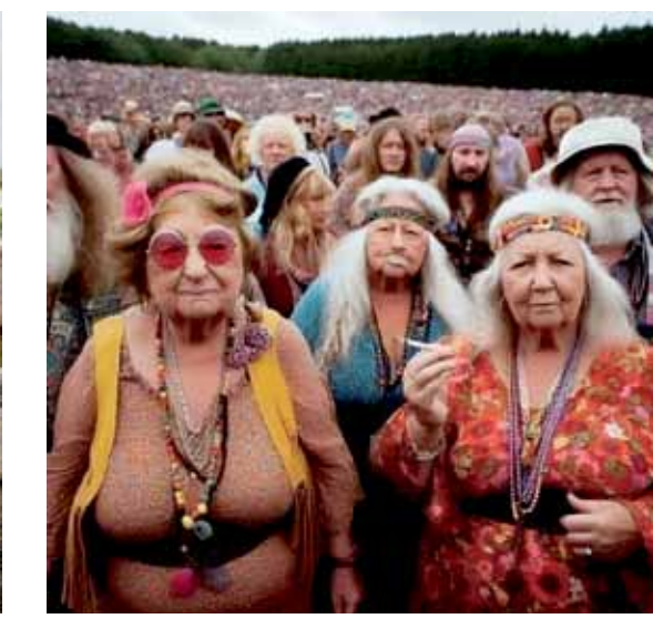
All ready for Musician's Relief Fund party at the Moose.