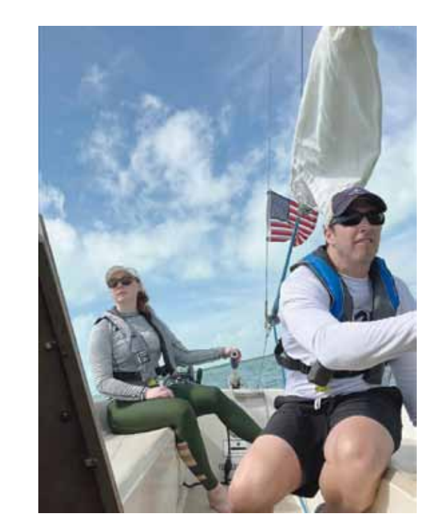
Elks Vets on the Water.