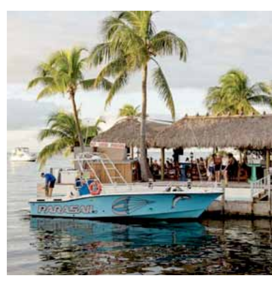
Pirates Cove Watersports.