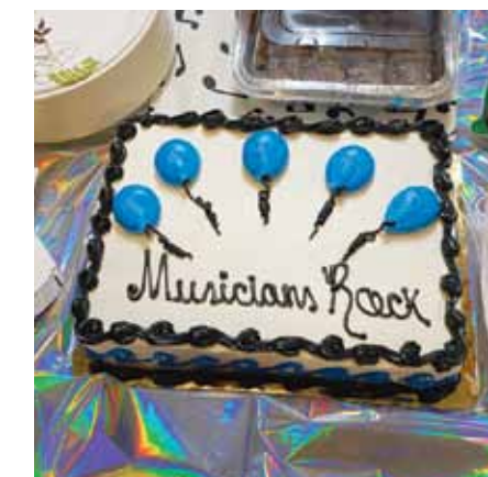
The perfect cake for the occasion