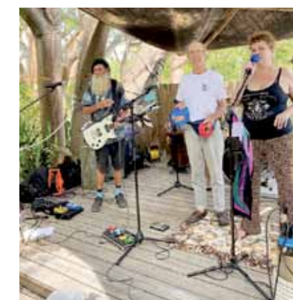
So many musicians turned out to jam for the cause!