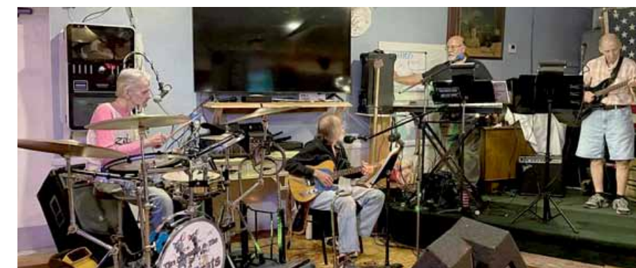
Key Largo Wood Rats took the stage