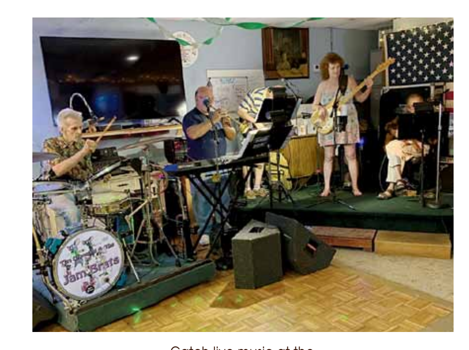
Catch live music at the Key Largo Moose every Wednesday night.