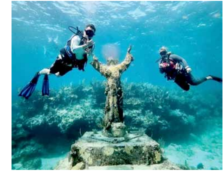
Pirates Cove Watersports at the Christ Statue