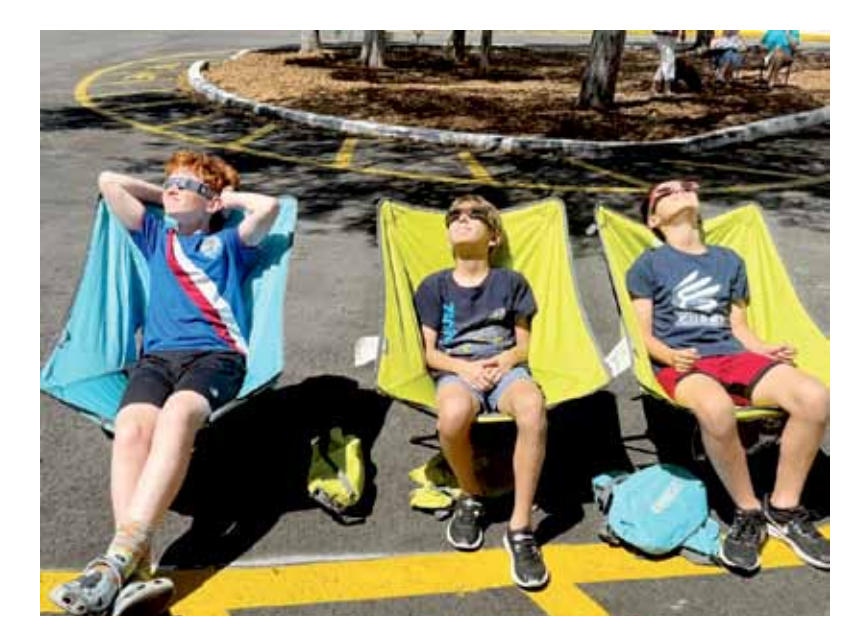
Three very chill guys watching the solar eclipse on April 8th.