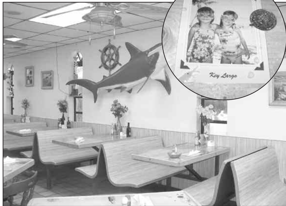
When you come by, be sure to take a look at the re-finished tables. Each one has a unique and personal touch including a picture of Spenser's adorable daughters.