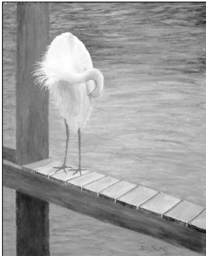
Riki Pheiffer's was the winner of the People's Choice Award at the Birds in Nature show during the 2008 Garden Walk.