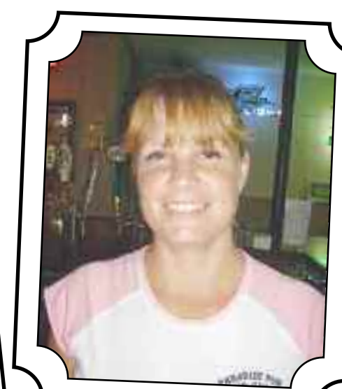
Carrie is now at the Paradise Pub!