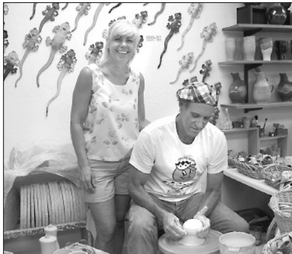
Story and photos by Rachel R. Peine

Before you even enter Bluewater Potters, your senses are aroused by the handmade ceramic door handle, glazed with the glowing turquoise of the waters of the Keys. Once inside, the colors strike you even more strongly, combined with designs of our local geckos, fish, and turtles adorning mugs, candleholders, lamps, and toothbrush holders.