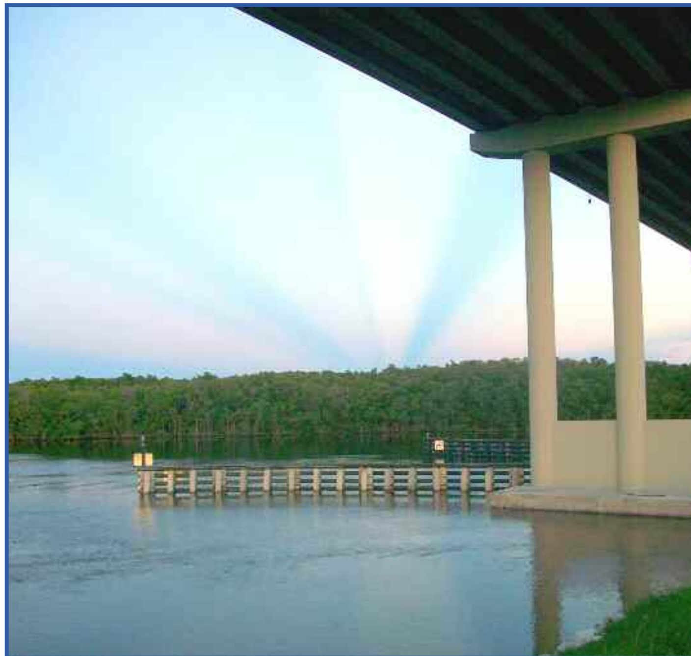
Florida Keys sunset at Gilbert's Resort.

You Can Find The Coconut Telegraph at over 100 locations from Homestead to Key West.