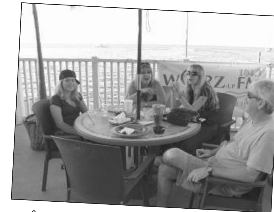
Some of the Hiddenout crew at the Party for the Pantry at the Big Chill.