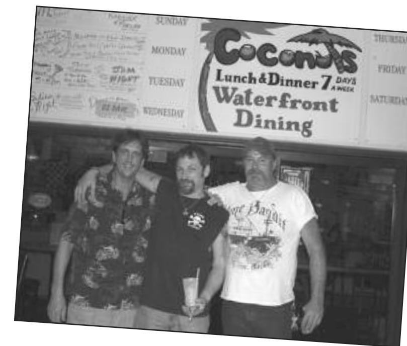
Deadliest Catch at Coconuts!