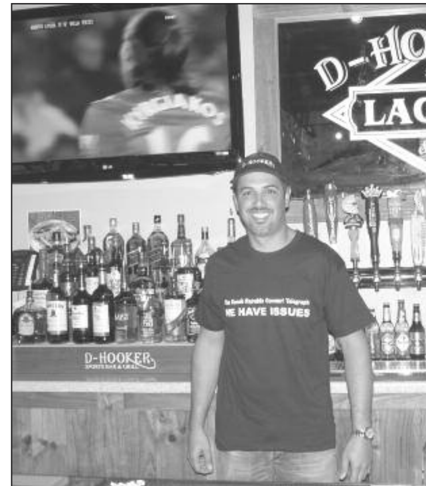
December's Hunk of the Month is proud to now be serving liquor at D-Hookers.