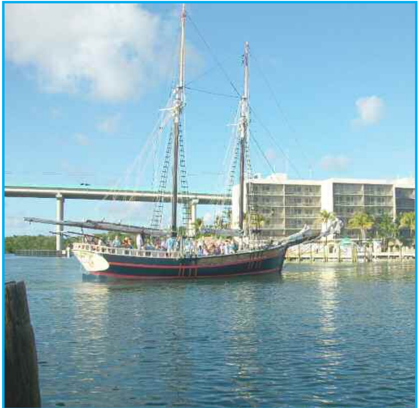
Pontune's own Queen Anne's Revenge sets sail for the sunset. Great afternoon activity!