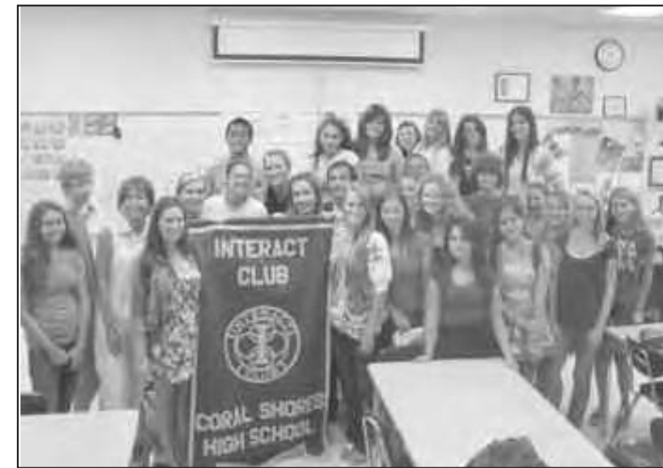
Members of this year's Interact Club at Coral Shores High School.