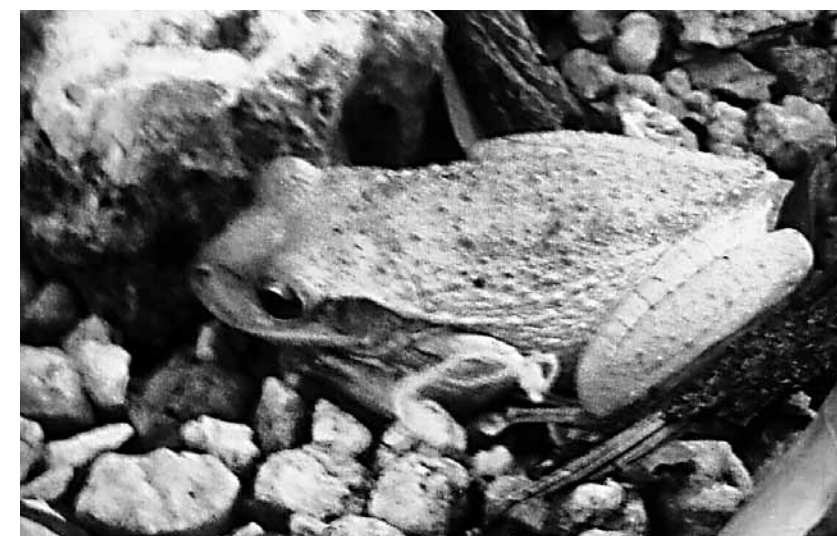
Albino frog found in Key Largo.

If things don't happen quickly, try not to be discouraged; it might take time to free up energy that has been blocked and possibly serving a purpose beyond what we can understand. If you continue your conversation with the universe, declaring yourself clearly and openly, you cannot help but experience the magic of changing and being changed.