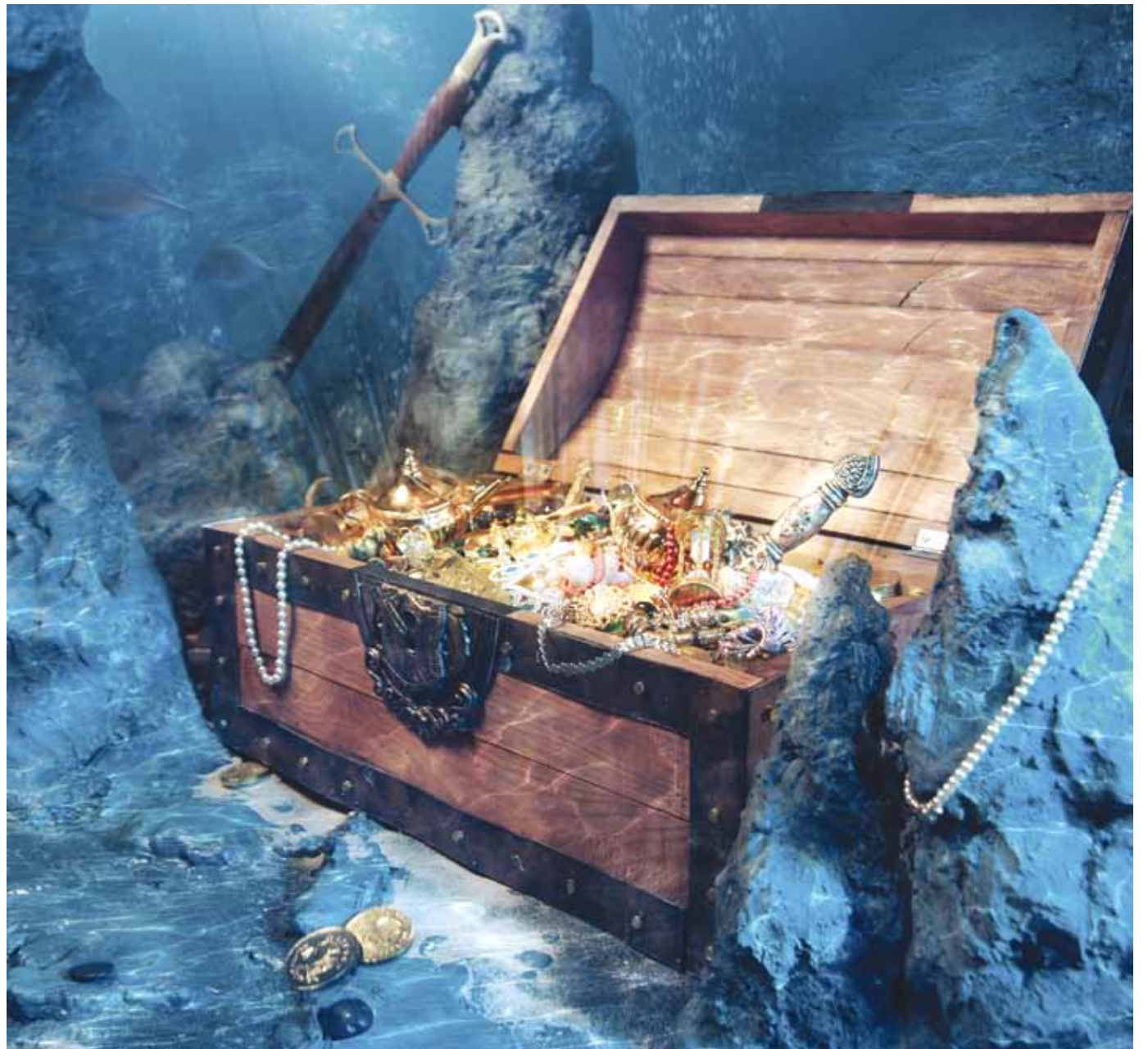
Coins... treasure or trash? In this issue read all about coin collecting, what to look for, and who to trust.