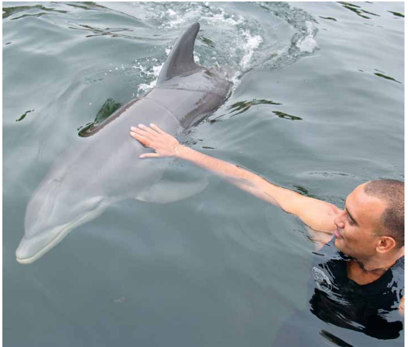
At Dolphins Plus, Baby Bit (BB) has reached a new milestone and is now interacting with guests in the structured swim!!! Her trainers feel BB's tenacious personality contributes to her newfound excitement about Dolphins Plus' structured swim behaviors. Here she can be seen participating in one of her first-ever moving rubs. Swim with BB at Dolphins Plus today! See page 17 for more information about Dolphins Plus and Dolphin Cove.

Coco-Nut Funnies Mangrove Galley: Cool Gazpacho Conch Characters Sounds of the Keys Business in the Keys