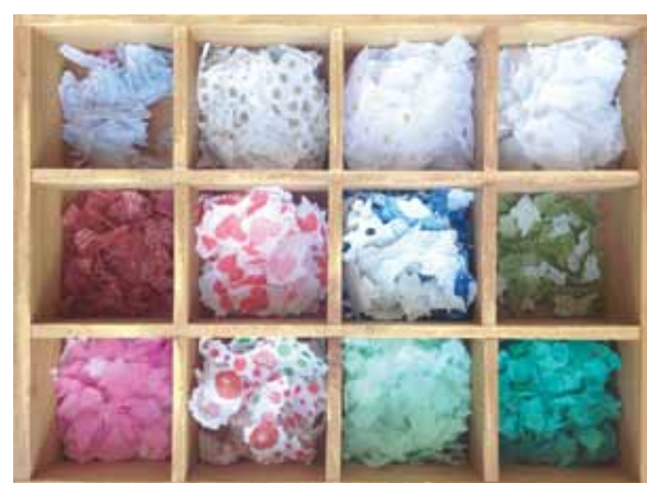
A palette of recycled tissue paper.