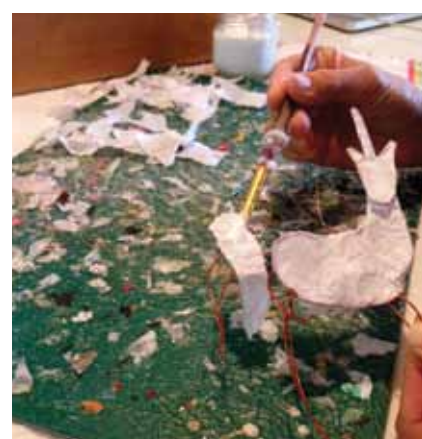
Application of paper to frame.