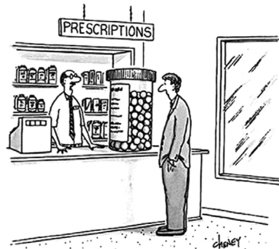
"It's a new anti-depressant—instead of swallowing it, you throw it at anyone who appears to be having a good time."