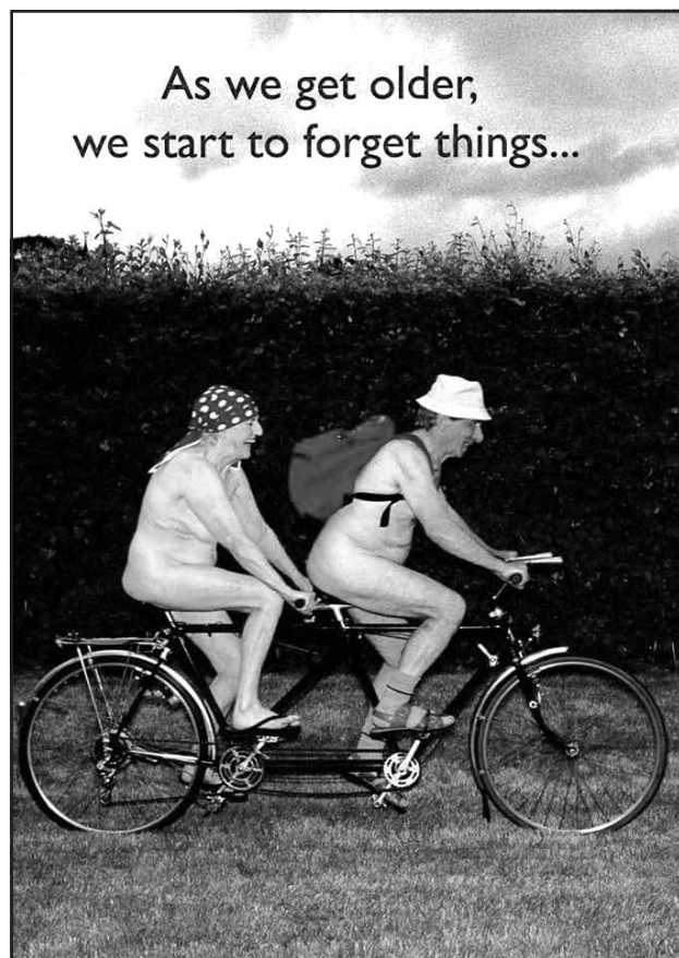
As we get older, we start to forget things...

People say that drinking milk makes you stronger.