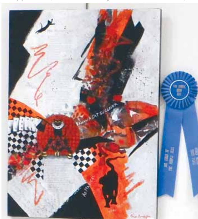
An award-winning, whimsical, mixed media collage. Left: This piece hangs at the Tassell Building in Tavernier.