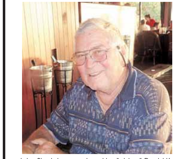
John Singleton