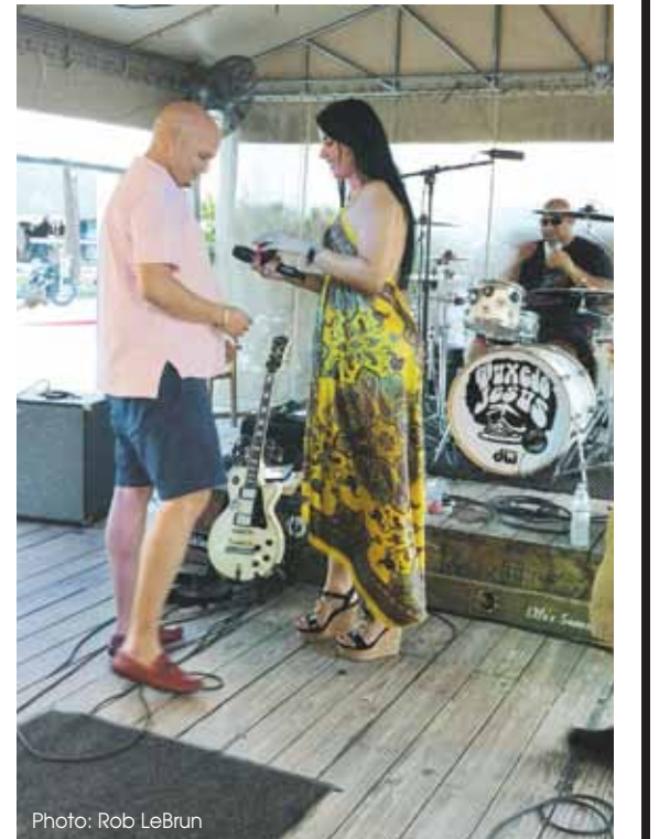
The "Tuxedo Jesus" band at Gilbert's took a break so this young lady could propose to her boyfriend!