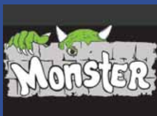
MONSTER Sunday, July 8 1-6pm