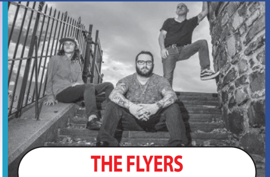
THE FLYERS Saturday, July 21, 7-11pm