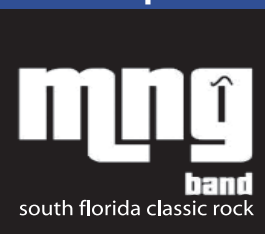
MR. NICE GUY Sunday, July 22 1-6 pm