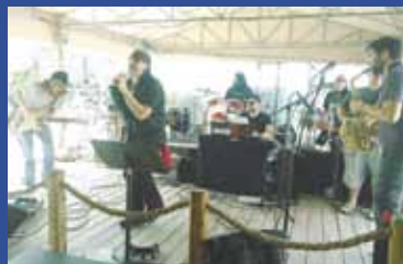
APACHE DRAGON Sunday, July 1 1-6pm