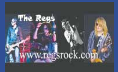
THE REGS Sunday, July 29 12-5pm