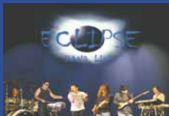
ECLIPSE Sunday, July 15 1-6 pm