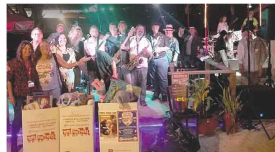
Toys for Tots at the American Legion Jam Night.