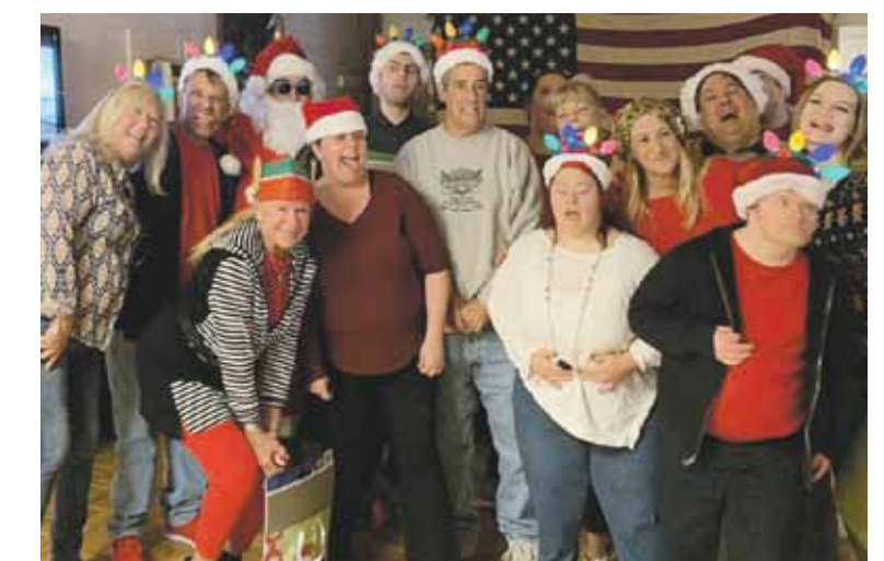
Key Largo Women of the Moose hosted a Christmas party for MARC.