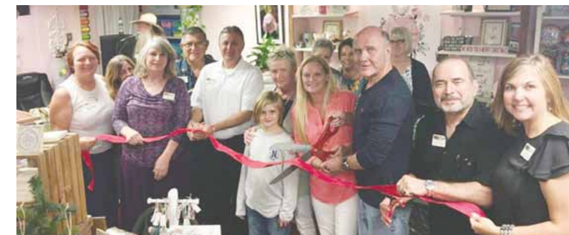
KL Chamber of Commerce at the ribbon cutting for the grand re-opening of Key Largo Flowers and Gifts.