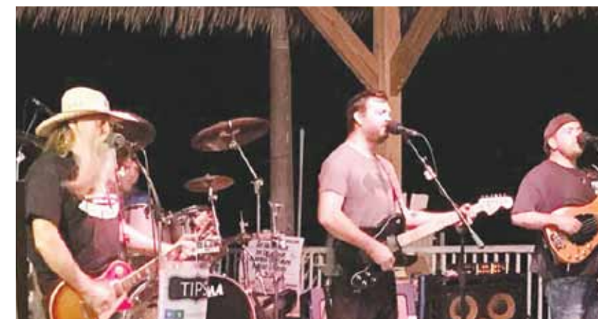
Uncle Rico entertains at the Big Chill.