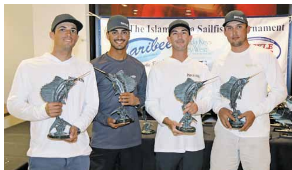
Priceless anglers came in second place.

The Islamorada Sailfish Tournament is the first leg of the Florida Keys Gold Cup Sailfish Championship. Last Dance is currently in the lead with 14 fish. Second place in the Gold Cup is Caribsea with 12 releases and third is Kalex with 10 releases. The next leg of the series is the Islamorada Fishing Club's Sailfish Tournament on January 24, 2019 and the champions will be crowned at the Cheeca Lodge Presidential Sailfish Tournament January 26-27. For more info: islamoradasailfishtournament.com