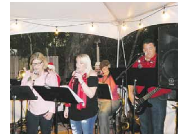
Burton Memorial Methodist Church singing Christmas carols at The Conch House.