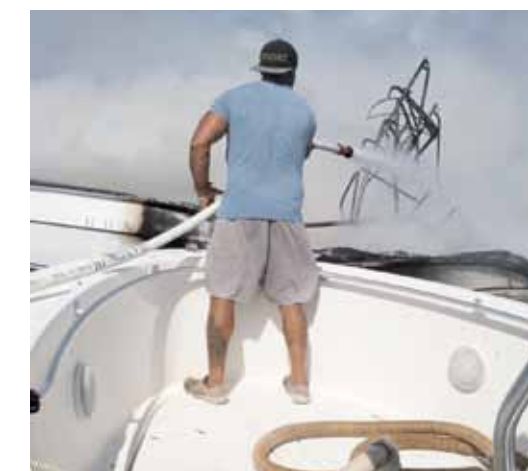
TowBoat US is fast to arrive on the scene.