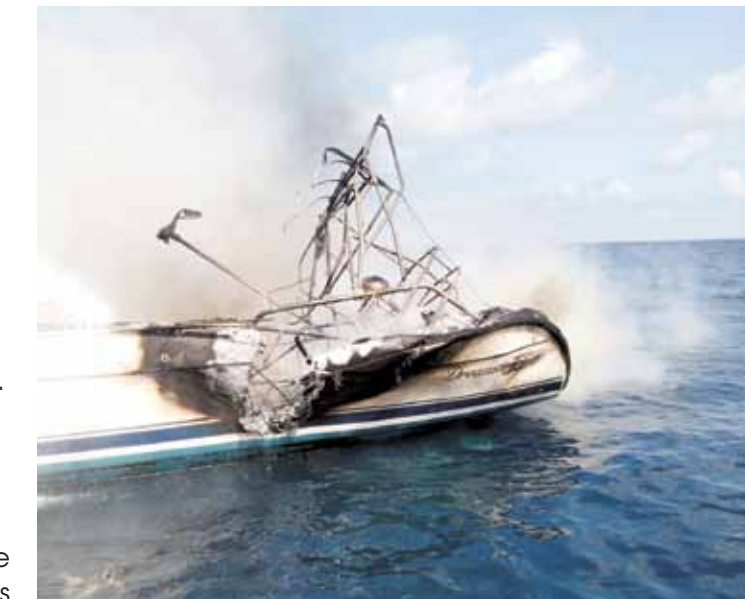
Boat fire in progress

Tow Boat US recently got called out to a boat fire offshore. Check out the photos to see the excitement they handle in their job!