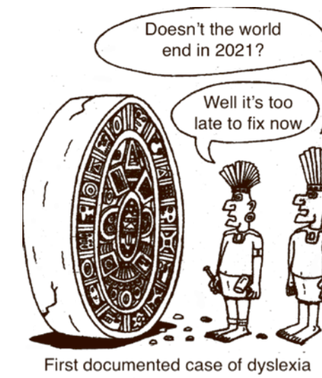
First documented case of dyslexia