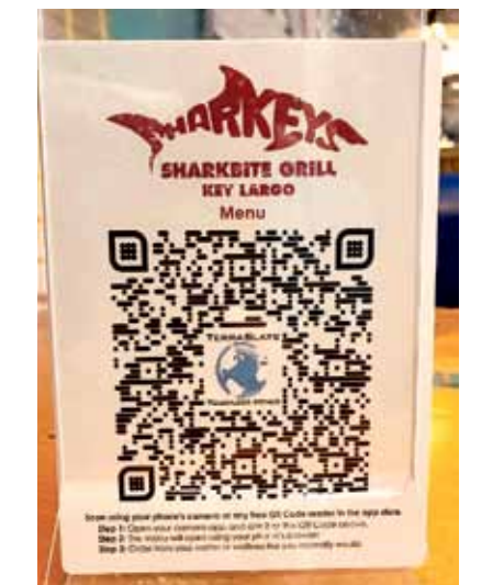
Sharkey's touch-free QR menu. It works!