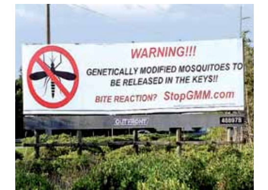
Billboard in Key Largo.