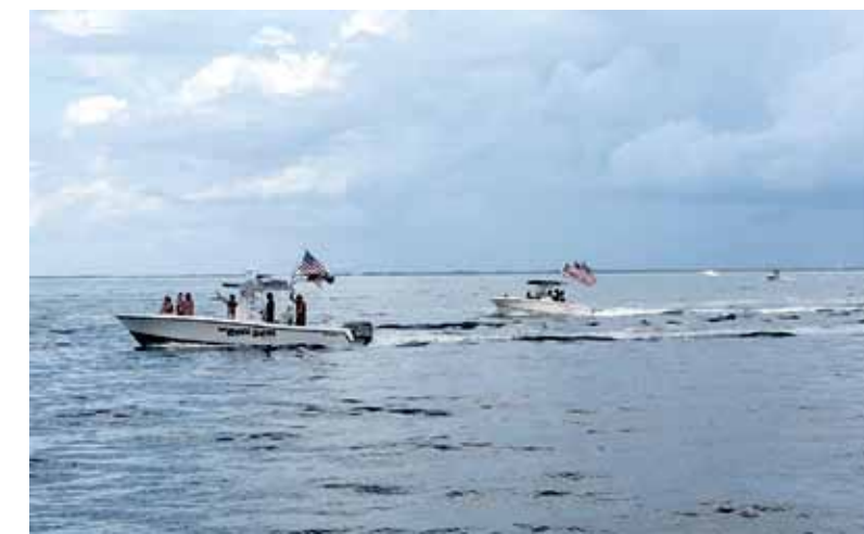
Key Largo folks celebrated July 4th with an informal boat parade - over 50 boats on Blackwater Sound.