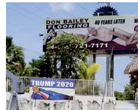
Spotted from the Adams Cut in Key Largo.