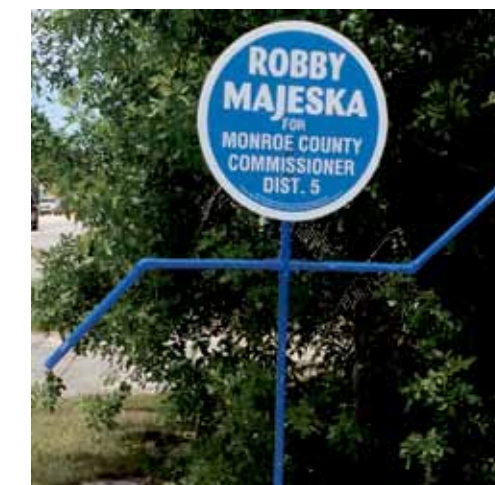
Robby Majeska campaign sign speaks for itself!