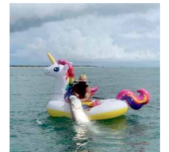
No boat? No problem!