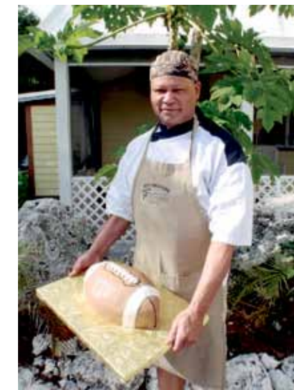
Cakes for all occasions.

energy. His band recently performed at the Ralphie Smith Bra Walk Strides Against Cancer event at the Caribbean Club. He