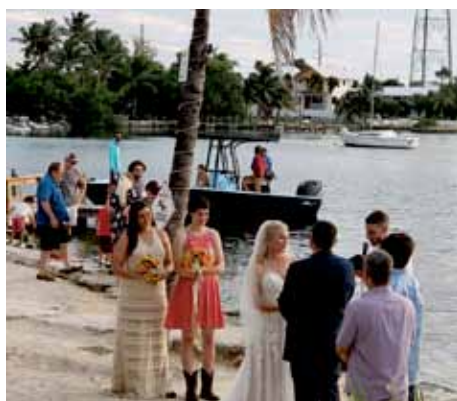
Recent Lorelei wedding - they can host your wedding or rehearsal dinner; LoreleiCabanaBar.com.