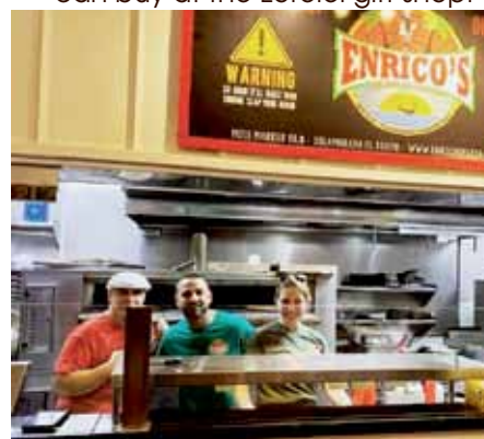
The crew at Enrico's in Islamorada.