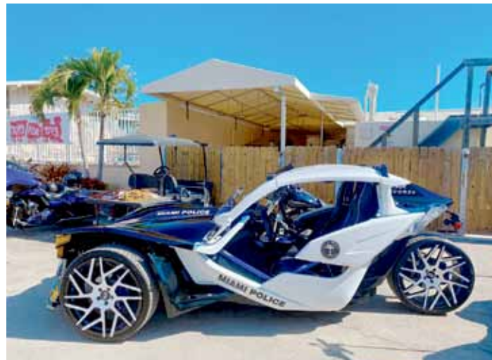
Annual Police Officer Assistance Trust Ride for Kids at Gilberts.