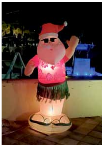
Santa greeted everyone coming into the Lorelei in December.