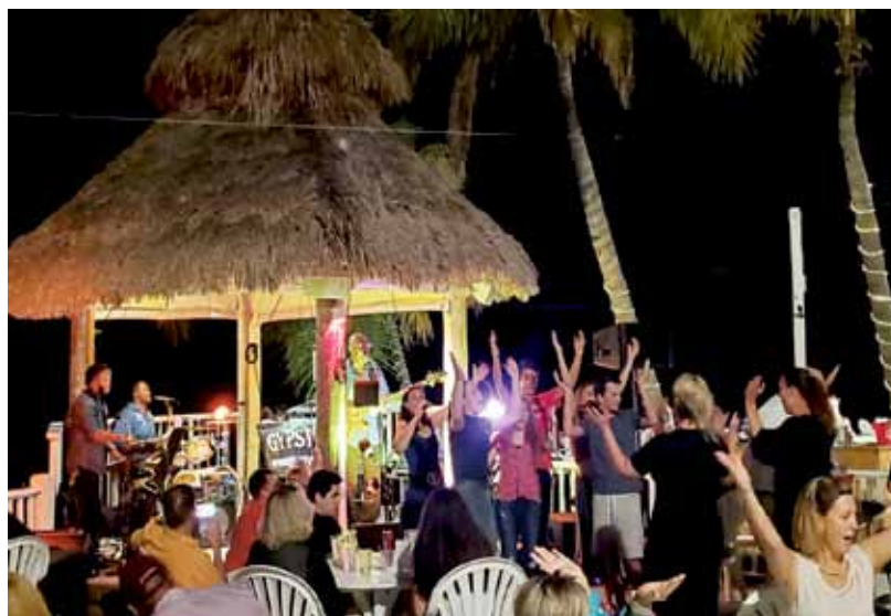
The Gypsy Lane band features two original members of The Village People, so of course they play that song at the Lorelei, to the delight of their fans!