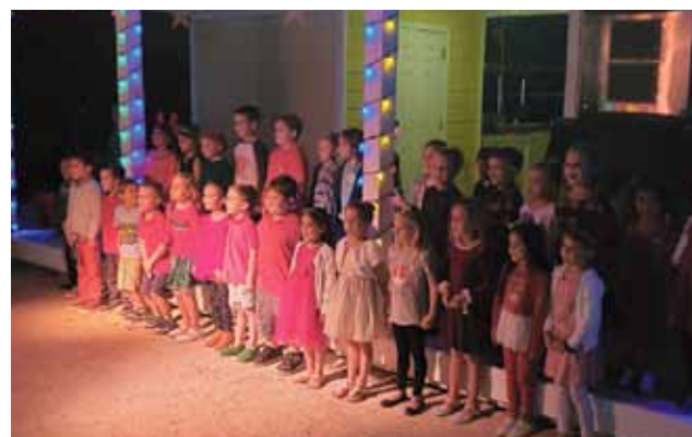
The PKS children sang Christmas carols at the annual fundraiser held at the Lorelei in early December.