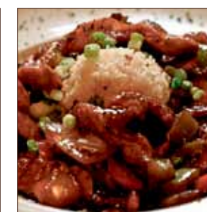
Kung Pao Bowl