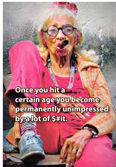
Once you hit a certain age you become permanently unimpressed by a lot of $#!t.

Amazon just got approved for drone delivery. We now have skeet shooting with prizes.