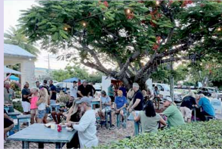
A great crowd!