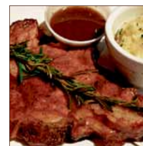
Prime Rib Dinner