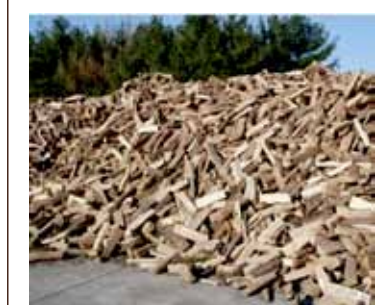
IKEA LOG CABIN KIT 305-555-IKEA