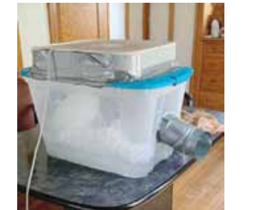
BRAND-NEW A/C UNIT Locally made! 305-555-COOL

ALSO AVAILABLE WITH ELECTRIC FENCE FOR COUPLES MARRIED 20+ YRS