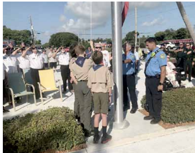
Memorial Day commemoration at the Hurricane Monument - Islamorada Fire Dept., Boy Scout Troop 912 and American Legion Post 145 raise the flag.