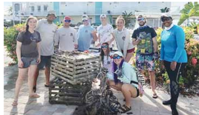
Early June cleanup was an epic win for Pirates Cove Watersports! They pulled up two lobster pots, 80ft of anchor line, 200ft of monofilament (fishing line)... all together a little over 162 lbs!