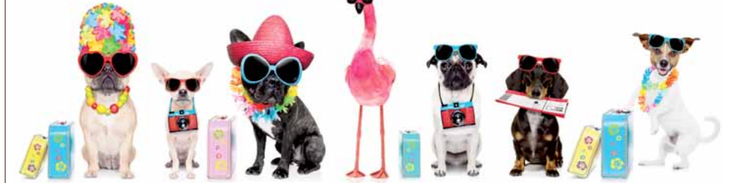
These are actual complaints received from dissatisfied customers by Thomas Cook Vacations.