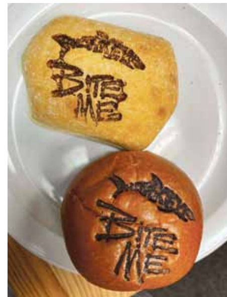
New at Sharkeys.