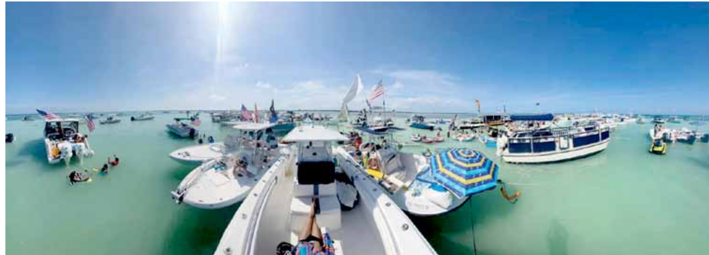
The Sandbar in Islamorada.