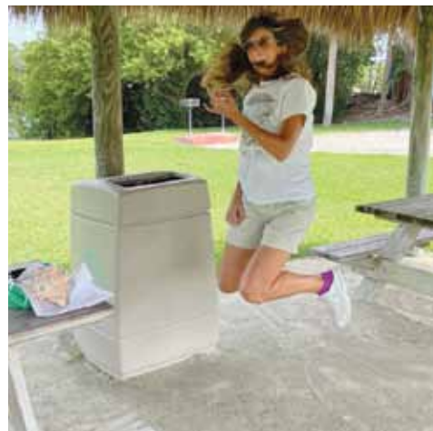
Air guitar jump at Florida Keys Food Tours.