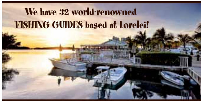
We have 32 world-renowned FISHING GUIDES based at Lorelei!