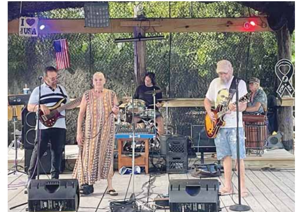
There's a lot of variety as players changed in and out.

The Key Largo American Legion is open 7 days a week from noon to 10 pm. Happy Hour is daily from 3 to 6 pm.