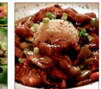
Kung Pao Bowl

WEDNESDAY to SUNDAY 11:30 am to 9:00 pm Pilot House Restaurant & Marina • 13 Seagate Blvd., Key Largo, FL 33037 (305) 451-3142 • info@pilothousemarina.com • https://www.pilothousemarina.com