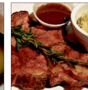
Prime Rib Dinner