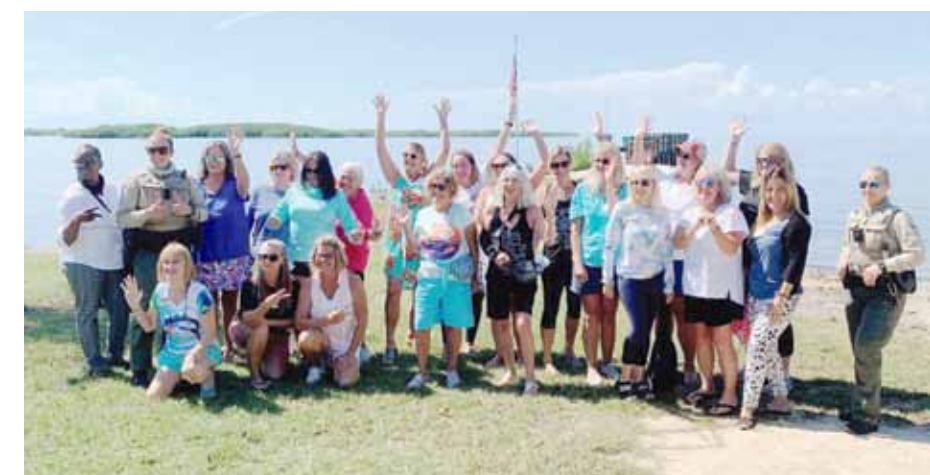
Graduates of Ladies Let's Go Fishing Florida Keys 2021 from several states.