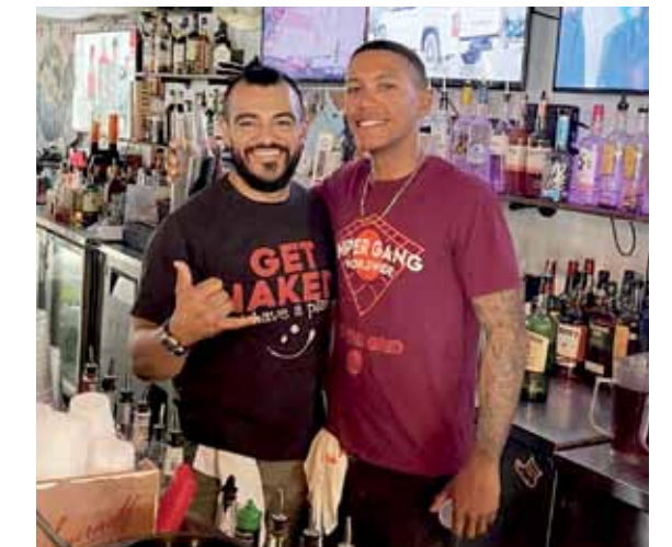
Handsome bartenders at Sharkey's!