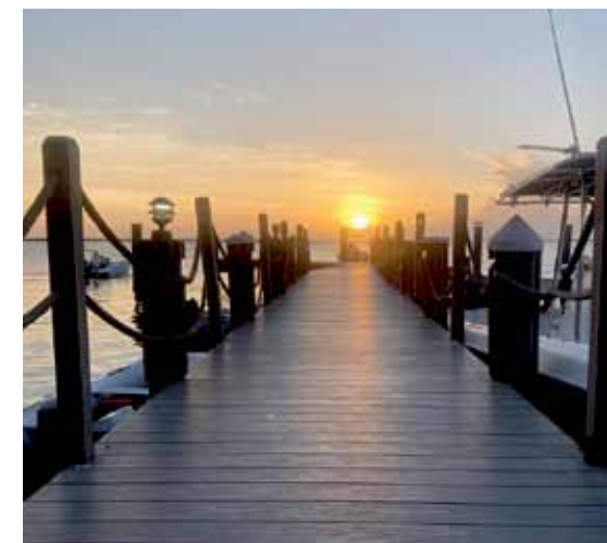
Best place to view the Key Largo Sunset? The Big Chill of course!