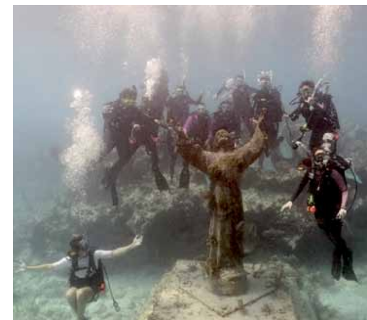
Pirates Cove Watersports dive at the Christ statue.