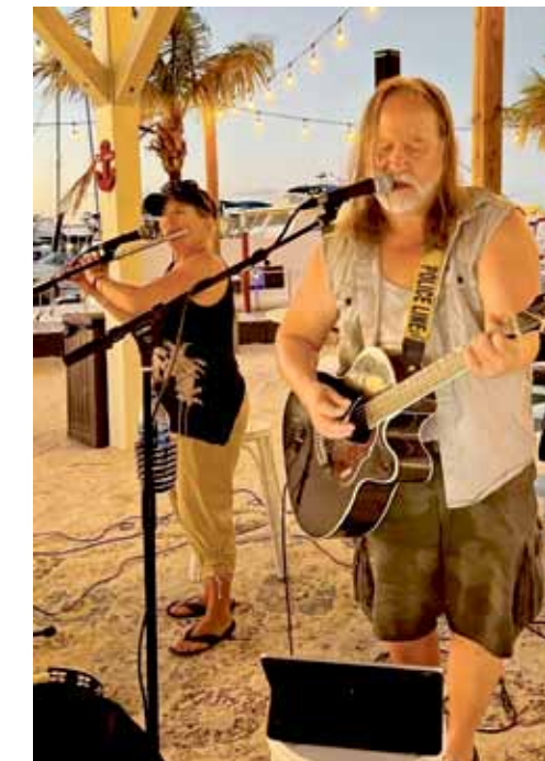
Live music at Big Daddy's Grub & Beach Pub at Mangrove Marina (MM92) on a Saturday evening.