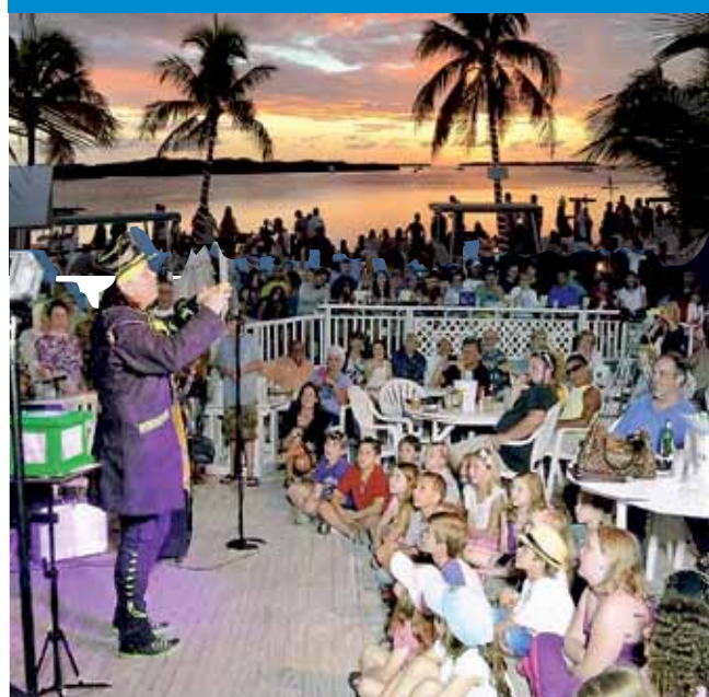
The Rockin' Magic of MICHAEL TRIXX Most MONDAYS • WEDNESDAYS • FRIDAYS at Sunset

Open for Breakfast, Lunch & Dinner • 7am-10pm Enjoy breakfast on the deck overlooking the water. Enjoy lunch or dinner on the beach.