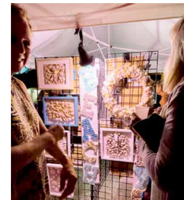
Morada Way Art Walk, every third Thursday, 6-9pm, MM 81 in Islamorada.