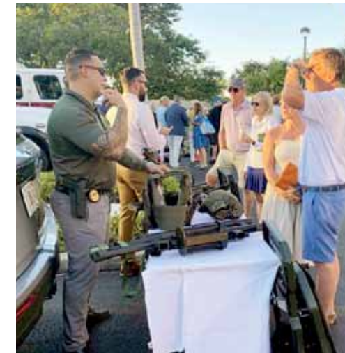
Sheriffs Office members displayed MCSO equipment at Ocean Reef and spoke with residents in January.