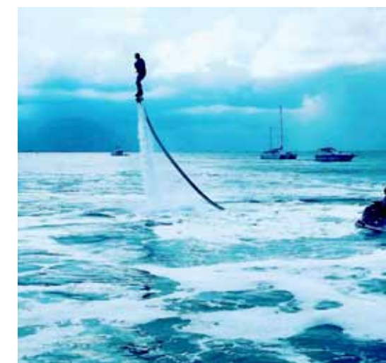
Jet Blade at the Big Chill.