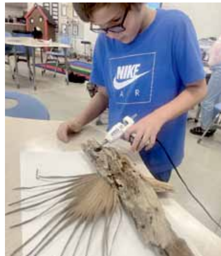
One of the students works on a piece.

Along with the student exhibits, 29 member artists