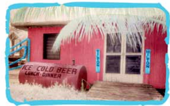
FRED'S TILTON HILTON - DOWNTOWN CARD SOUND ROAD

Discount code "CONCH" for 10% off fishing shirts