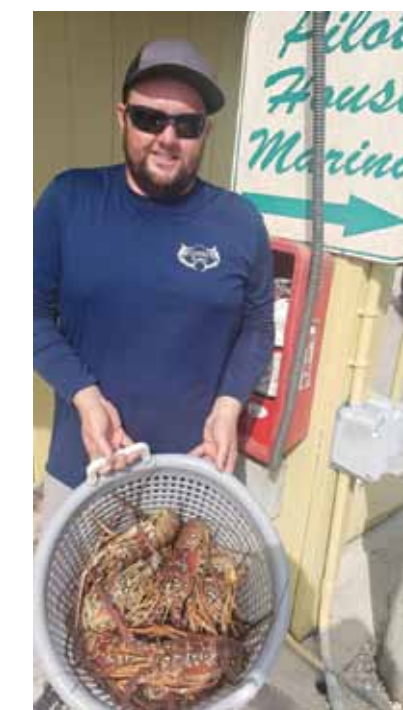
Lobster at the Pilot House Marina.