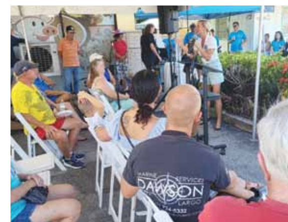
Gathering at Juice House against moving courts out of Monroe County.