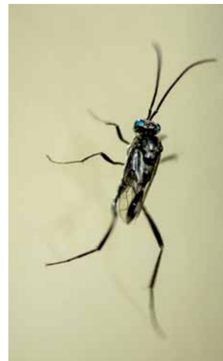
Evania appendigaster, also known as the blue-eyed ensign wasp.

dimension was about the size of a dime. Whenever I opened the sliding glass door to go onto the porch, the creature would buzz my face, land on a wall, briefly, then buzz me again. It was trying to be my friend, I think. But what was it? I am not naive when it comes