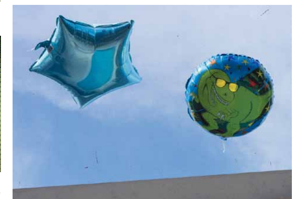
Helium balloons float around our screen enclosure forced the spiders to retreat to higher ground.

Their webs are about 12 inches across, with many connecting strands. The patio is covered with them, but the lowness was bugging me! I discovered a solution by accident, when a helium balloon got loose on the