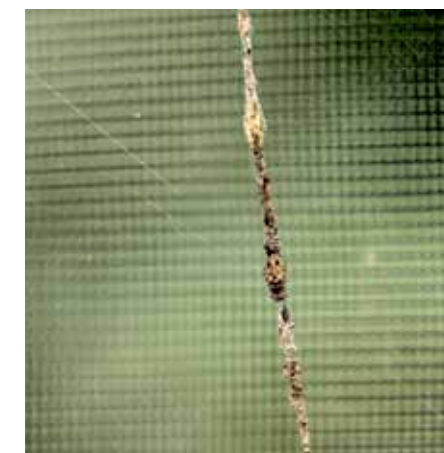
Baby orbweavers stay inside the egg case for several weeks where they learn to move around.

egg casings. The wasps' eggs hatch, and the larvae eat the roaches within the egg case. These wasps are not known to sting humans. So what do you do if you find an Ensign wasp in your house? Leave it alone to look for cockroaches!