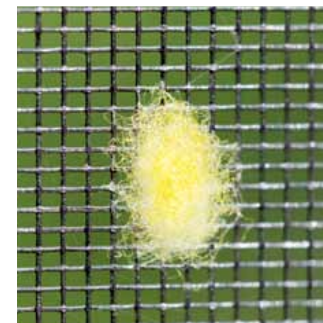
Spiny Orbweaver spins a yellow and white silky case to house 100-260 eggs, and provide nourishment for developing young spiders.