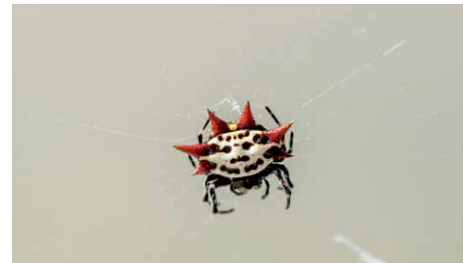
Spiny Orbweaver. The spider has six pointy "thorn-like" projections around its body, and are bright red, yellow, black and white in color.

Since the fly creature was friendly, it allowed me to photograph it. Via my post on iNaturalist, my "super spy" creature was identified as an Ensign wasp. These wasps live to exterminate cockroaches! Indeed my friend! Evania appendigaster, also known as the blue-eyed ensign wasp, lay their eggs in cockroach