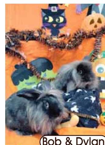
Bob & Dylan

Meet a few of the animals who are currently available for adoption at the Key Largo Animal Shelter. If you are interested in taking one of these adorable furry friends home, stop by or call. The Shelter is located at mile marker 106 Oceanside; phone 305-451-0088.