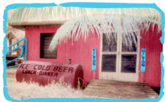
FRED'S TILTON HILTON - DOWNTOWN CARD SOUND ROAD

SPF 50, long sleeve, fishing performance shirt in aluminum, blue mist or white.