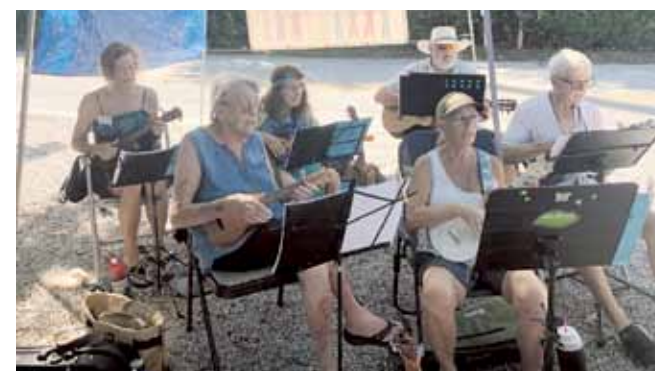
Ukulele JOY, one of the many activities offered by the J.O.Y. Center, (Just Older Youth), plays for customers at the Midway Cafe the first Sunday of every month. Free beginner ukulele classes will be offered Thursdays 12:30-1:30 at the Key Largo Library during the month of September. Come JOYn the fun!