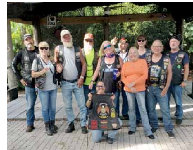
Legion Riders from Tampa stopped by the American Legion in Key Largo