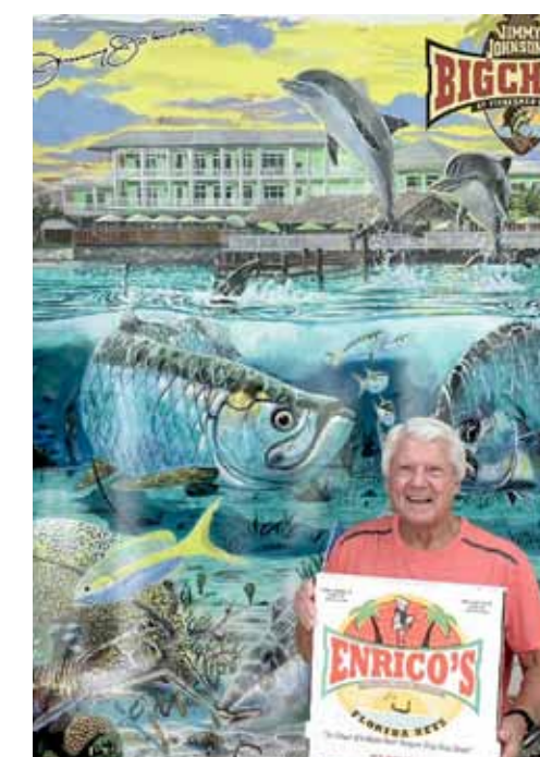
Coach is excited about the new delivery options at the Big Chill.