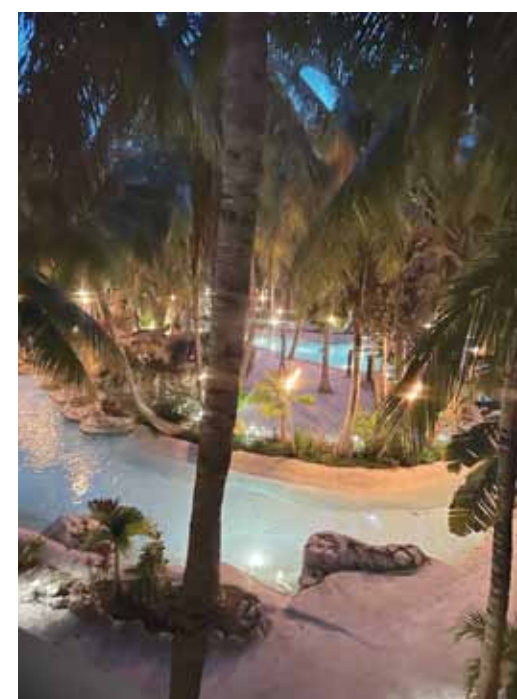
Beautiful Cheeca Lodge.