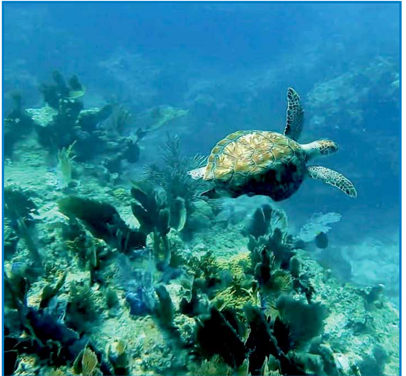
"Been there, done that" and get the tee shirt too at Pirates Cove Watersports. See page 14 for their ad.