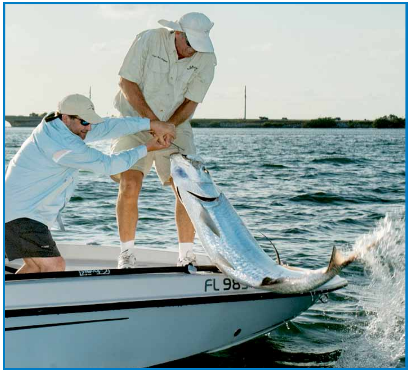
After following a tarpon through the concrete arch of the former Florida East Coast Railway Extension at Channel 5 in Islamorada and fighting it as it leapt, the fish was landed with this photo catching the action. For more details, read Carol Ellis' article on pages 4 & 5 inside.

Coco-Nut Funnies Business in the Keys Adopt a Key Largo Shelter Pet Conch Characters