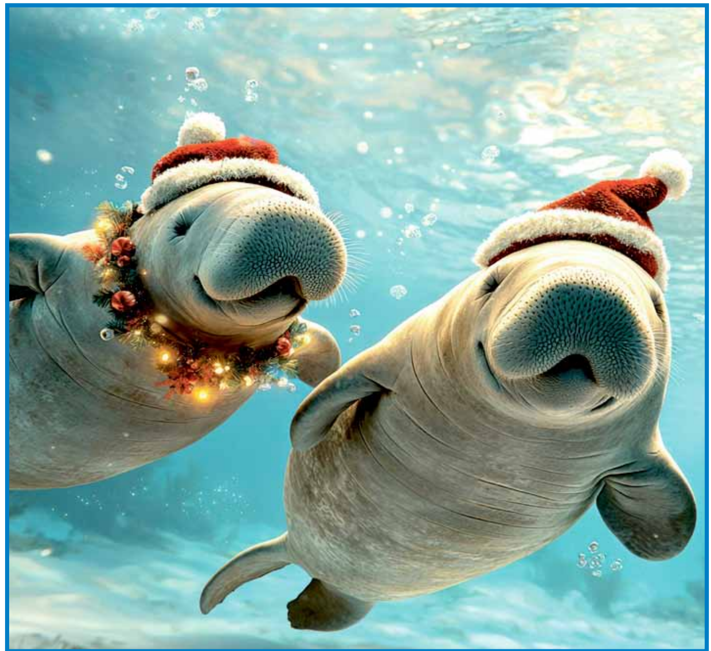
Two playful manatees wearing Santa hats swim together, to lift your holiday spirit. How do we know they don't do this when we aren't looking? Have fun this holiday season!

Coco-Nut Funnies Business in the Keys Adopt a Key Largo Shelter Pet Conch Characters