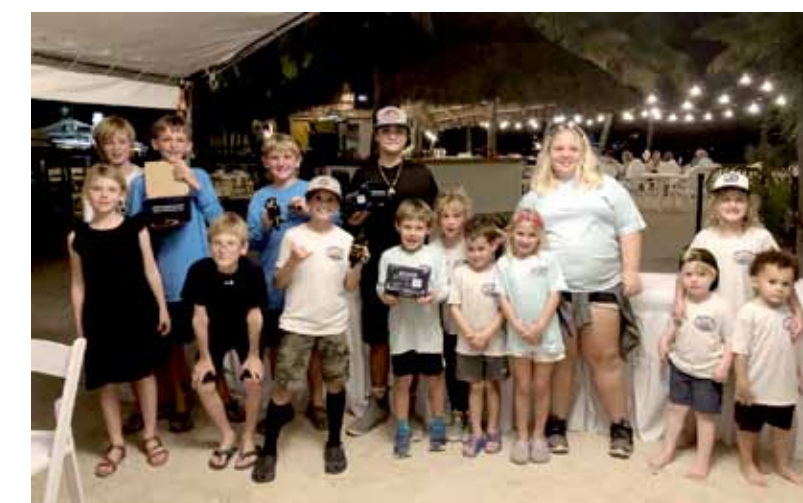
2024 Anglers in the Keys Kids Sailfish Tournament.