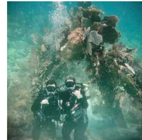
Diving with Pirates Cove Watersports at MM 104.