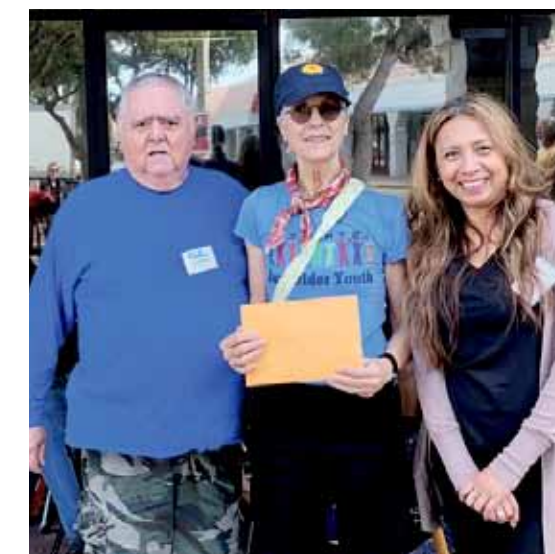
Ukulele JOY, of the Just Older Youth, Inc. aka The JOY Center, entertained the people who came to the Center For Independent Living of the Keys sponsored Accessible Vaccine Clinics. Your next opportunity for a free vaccine, and to listen to Ukulele JOY is Feb 12th, 10-2.