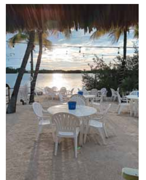
Beautiful view from the Lorelei!