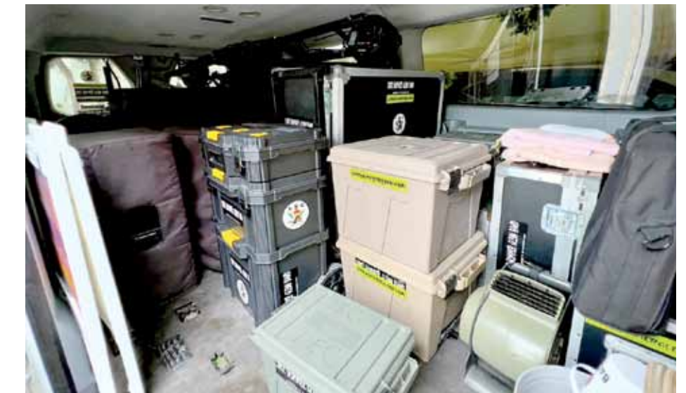
From the high of playing for several hundred people to the agony of trying to dry wet, sandy cables and soggy equipment... the acrid smell of mold and mildew already overtaking the sweet smell of Mary Jane in the van.