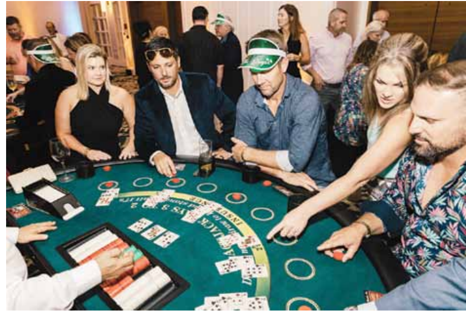
Habitat's 2023's event was a casino-themed evening.

Mark your calendar to save the date for a spectacular evening of fun, fashion, and philanthropy at the Habitat for Humanity of the Upper Keys 21st Annual Cocktail Party. On Friday, MARCH 8, 2024, Habitat will host a Kentucky Derby-themed cocktail party/fundraiser at the Cheeca Lodge & Spa, to include Derby attired guests, food stations, dancing, live and silent auctions.