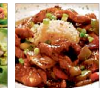
Kung Pao Bowl