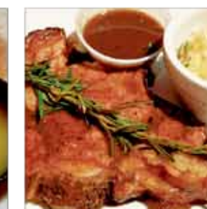
Prime Rib Dinner